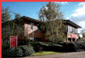
Protocol National's corporate headquarters in Nottingham