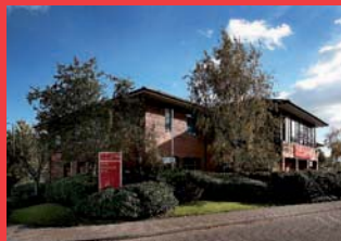
Protocol National's Corporate Headquarters in Nottingham

College Recovery Service Improve Human Resources Task Force College Services Support Conferencing Service Payroll Bureau Gold Standard Interims