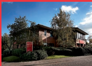
Protocol National's Corporate Headquarters in Nottingham

Observe Improve Human Resources Task Force College Services Support Conferencing Service Payroll Bureau Gold Standard Interims