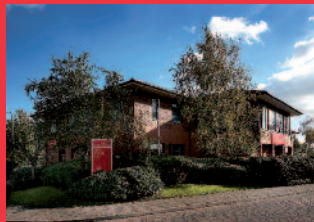
Protocol National's Corporate Headquarters in Nottingham